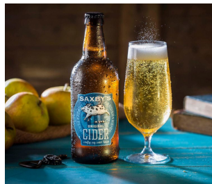
▲ Saxby's Cider donated a Cidery Tour auction prize.