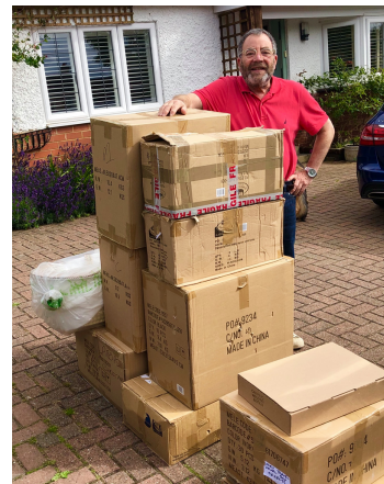
▲ Baby Fish Gifts in Great Addington donated a huge amount of their stock, which will be resold to raise funds for the Hospice.