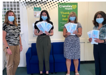
▲ Millbrook Healthcare donated masks to the Hospice.