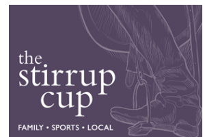
▲ The Stirrup Cup supported our choir with free room hire.