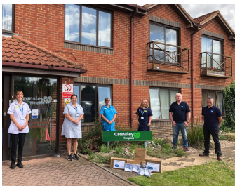
▲ ESB Corby Power Station donated thermometers, blood pressure monitors, cuffs and pulse oximeters.