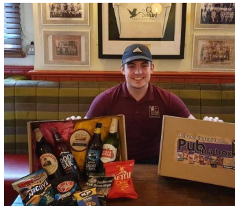
▲ The Old Swan, Earls Barton donated a 'Pub in a Box' auction prize.